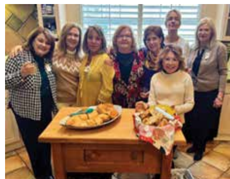
Diamondhead PEO Chapter U