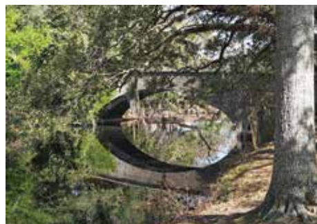
DH Geaux Hiking Lagoon Bridge Audubon Park.

Our next planning meeting will be Tuesday, April 1, (no foolin') at 6:00pm in the Kanaka room at the DH Country Club and we'll be making plans for our May, 2025, hikes. Come with your excellent suggestions for places to get out and enjoy our beautiful surroundings.