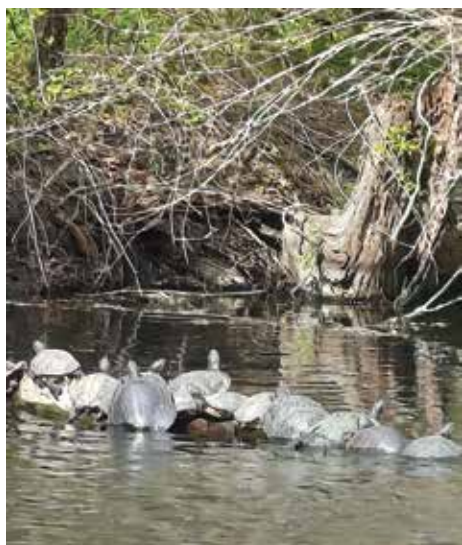
DH Geaux Hiking Audubon Park Turtles.

Thursday, April 24-- Boat Trip to Ship Island to hike along the beach and tour the historic Fort Massachusetts. Pack a small cooler/picnic