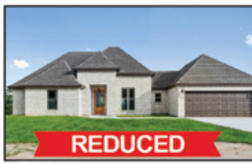
8025 Ridgewood Dr | Kiln 4 bed | 2.5 bath 2165 sqft | $429,900

Newly constructed home nestled on spacious 2-acre lot in Kiln. Modern French Acadian design with an open & split floor plan and so much more.