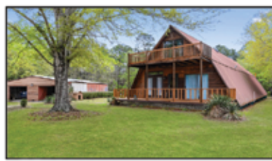
25541 Broadridge Dr | Picayune 4 bed | 2 bath 2339 sqft | $275,000

Newly constructed home nestled on spacious 2-acre lot in Kiln. Modern French Acadian design with an open & split floor plan and so much more.