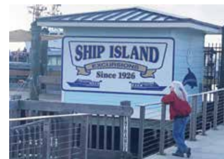
DH Geaux Hiking Dreaming of Ship Island.

Saturday, April 5--Regularly-scheduled first of the month hike on Fountainebleau Trail, in Ocean Springs. This hike is sponsored by the Jackson County Recreation Department, Mississippi Sand-