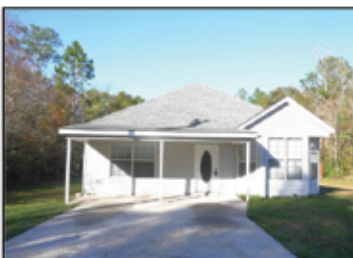
7076 W Perry St. Bay St. Louis 3 Bed | 2 Bath | 1297 sqft $129,000