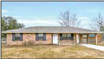
806 Willow St | Waveland 3 Bed | 1 Bath | 1,189 sqft | $175,000