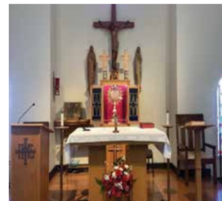
Most Holy Trinity Catholic Church

Sunday: 7:30, 9:00, 11:00 a.m. & 7:00 p.m. Reconciliation: Saturday 3:00-3:30 p.m., or by appointment Hospital Ministry – 7 days a week MHT Pastor, Deacons, and/or Eucharistic Ministers visit Memorial Hospital in Gulfport to serve Holy Communion to Catholic patients and staff. Homebound Ministries – Weekly visits to the parish homebound. Also, the Homebound ministry provides meals twice a month. Nursing Home - Weekly mass (or Communion Service) to the residents of Woodland Village nursing home. 40 Hours Adoration - MHT Adoration Chapel is open Monday 11am-9pm; Tuesday 9am-7pm; Wednesday 6am-4pm; Thursday 9am-7pm. (see picture). Adult Faith Formation - Sundays 10:00-10:45am on different topics weekly. First weekend Mass Talks – Speakers prepare a talk on the Eucharist each month during the 3-year National Revival. New Quad Chapters on the Eucharist. MHT leadership team are writing new quad part 5 with 11 lessons to bring the Eucharist more into the quad study.