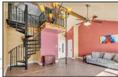
113 Sunridge Park Gulfport