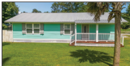
307 Turner St | Bay Saint Louis 3 Bed | 2 Bath | 1104 sqft $292,000