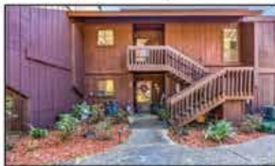
208 Kona Villa | Diamondhead