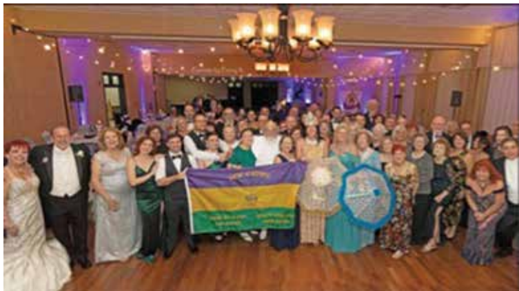
Krewe of Olympus 2025 Grand Ball