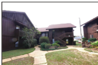
242 Molokai Diamondhead 1 Bed | 1 Bath | 639 sqft $103,000