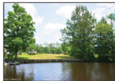
15067 Chickasaw Rd | Kiln Jourdan River Shores Waterfront Lot | 0.11 Acre $110,000