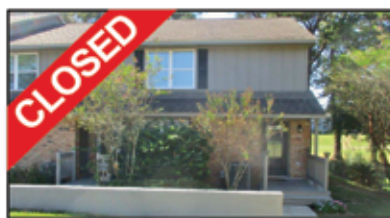
415 Highpoint Dr Diamondhead 2 Bed | 2.5 Bath 1217 sqft | $219,000