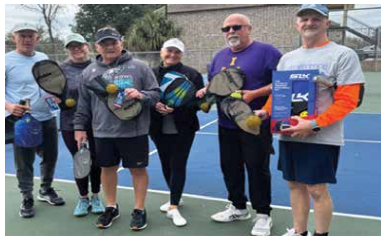
Diamondhead Pickleball Players supporting the Hancock Boys and Girls Club