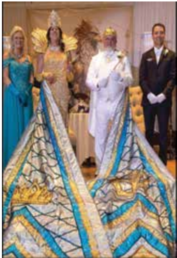
Krewe of Olympus 2025 Grand Ball