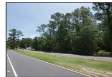
85537 W Diamondhead Dr Diamondhead 2 Lots | 0.46 Acre $62,000